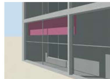
Graphic: Greenhouse with curtains or stores inside of the gallery.