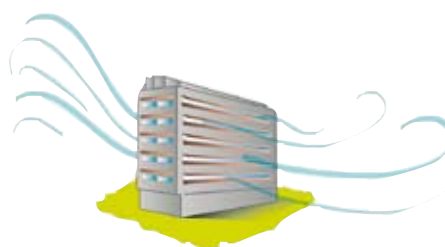
Graphic: crossed airing inside of households

Data obtained through the Command networks have already been launched, therefore the results after the monitoring of households are being compared with those from simulations.